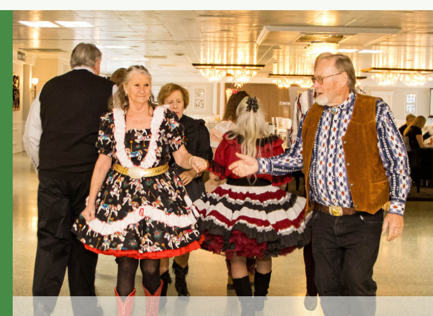
Square dancing at our 2022 Benefit Dinner!

We had 23 generous organizations help us along the way to our $110,500 goal at our 2022 Benefit Dinner. Can you or a business you know make our 2024 retreats and community events possible by sponsoring this year's Benefit Dinner? Check out our <u>Sponsor Form</u> for more info!