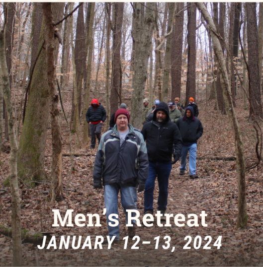
Men's Retreat JANUARY 12-13, 2024

Winter specialty retreats are the overnight getaway you'll be craving after a busy holiday season and a gray winter indoors. Plus they're free to families of children with disabilities, so you can't beat the price! Applications will open in December, so save the dates and keep an eye on our socials for links to apply. All retreats are hosted at our Retreat Center in Scottsville, KY.