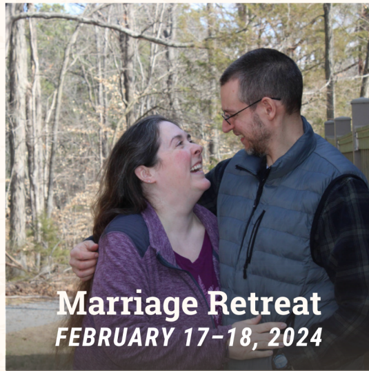
Marriage Retreat FEBRUARY 17-18, 2024