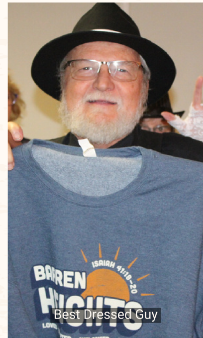
Best Dressed Guy