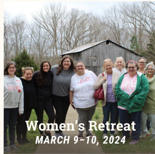
Women's Retreat MARCH 9-10, 2024