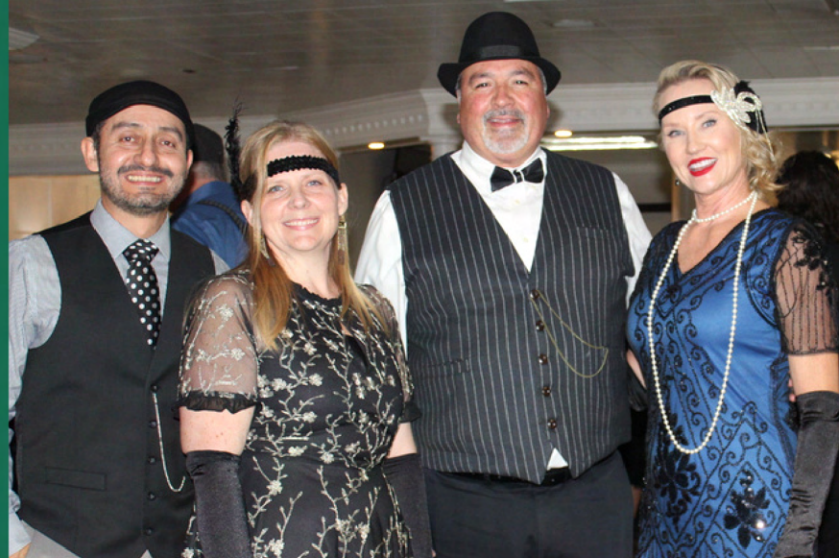
Dancing into our Roarin' 20s at last year's dinner!

We had 19 generous organizations help us along the way to our $115,000 goal at our 2023 Benefit Dinner. Can you or a business you know make our 2025 retreats and community events possible by sponsoring this year's Benefit Dinner? Check out our Sponsor Form for more info!