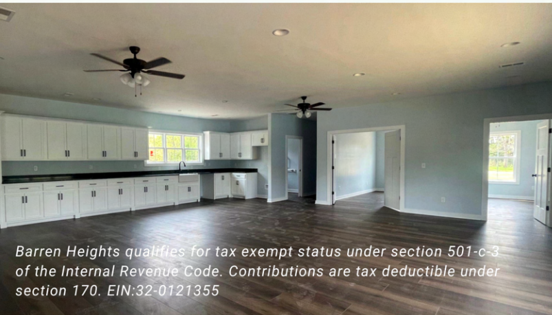
Barren Heights qualifies for tax exempt status under section 501-c-3 of the Internal Revenue Code. Contributions are tax deductible under section 170. EIN:32-0121355

Want to help us finish and furnish the Lodge? Take part in our Launch the Lodge Brick Fundraiser! Purchase a personalized brick in honor of a precious friend or in memory of a treasured loved one. The bricks will be used to pave a feature next to the Lodge where guests of the Retreat Center can take a moment to rest. Purchase yours at fundraisingbrick.com/thelodge/ or make a donation HERE .