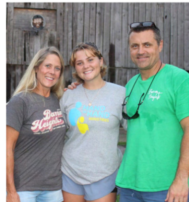
Volunteer Training on 4.24