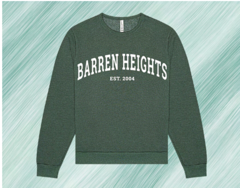
Sweatshirt Fundraiser ends at midnight on 2.28

As winter comes to a close, Barren Heights is just getting started! We have many opportunities for our community in the near future, so grab your calendar and jot down these dates. Click images for info and registrations.