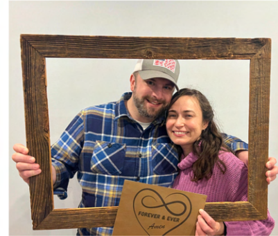
2025 Marriage Retreat