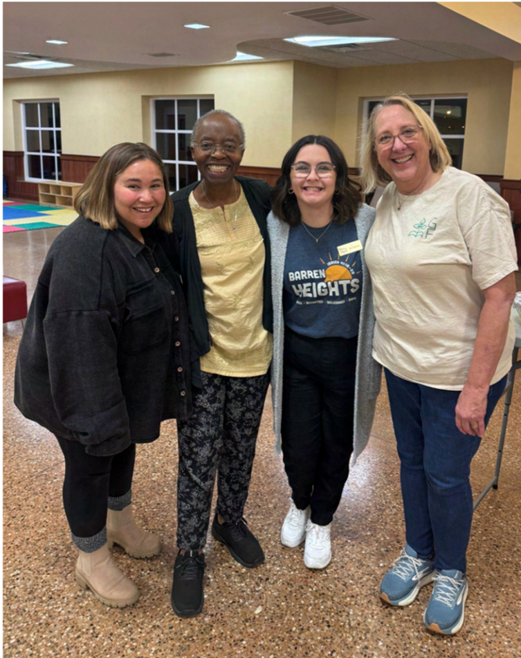
Launched Growing Families Partnership in February

A lot has happened at Barren Heights since the last edition of our newsletter hit stands in October. Here are just a few of the many highlights. To see all the fun things we'll be getting up to this year, make sure to join our email list at barrenheights.org/email .