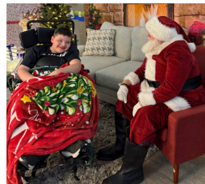
2024 Christmas Party