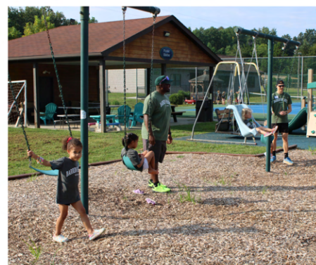
Playground makeover coming soon!