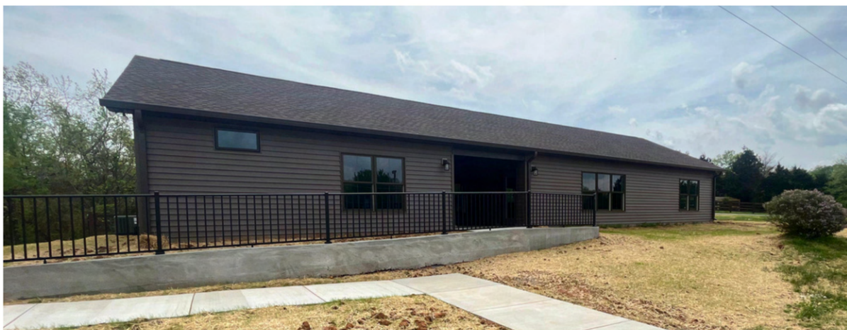
2025 will be our first full year of having the Lodge for both winter and summer retreats!