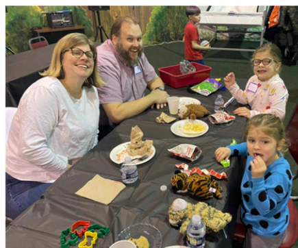
2025 Family Fellowship