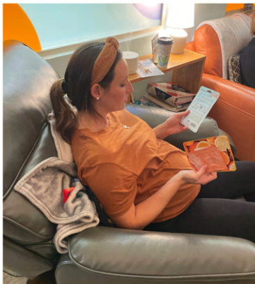
MNO RSVPs open 3.6