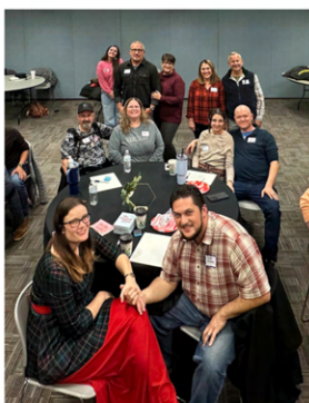
2024 HoliDate Night