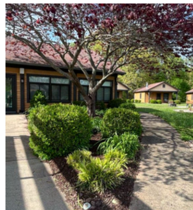
Spring Campaign ends 5.15