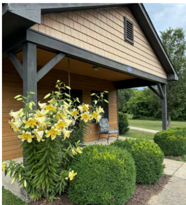
Spring Campaign begins 5.5