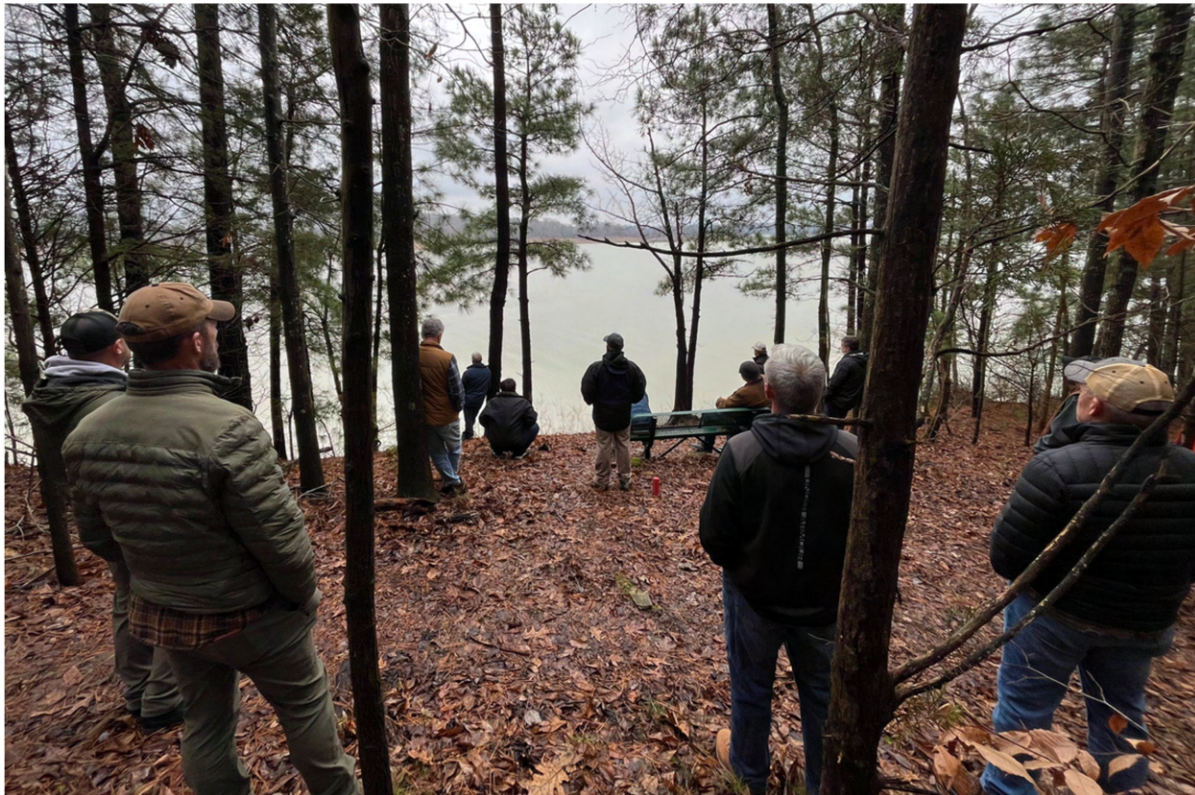
Men gather at our 2025 Men's Retreat weekend on January 18th–19th

The weather has been cold. We've had too much rain and some might even say too much snow. But we here at Barren Heights have still been serving families of children with disabilities!