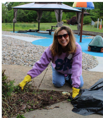
Work Day at BH on 5.10