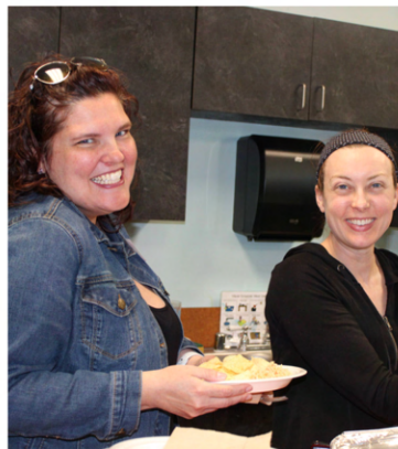
Mom's Night Out on 4.17