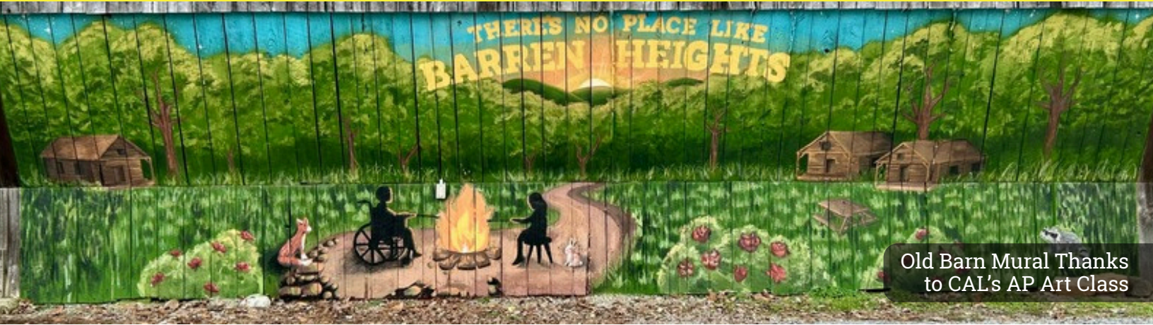
Old Barn Mural Thanks to CAL's AP Art Class