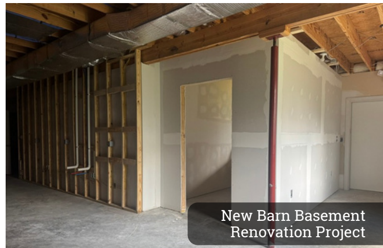
New Barn Basement Renovation Project