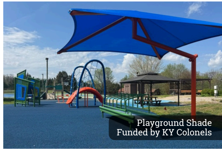
Playground Shade Funded by KY Colonels

This summer's theme at Barren Heights is "Refreshing Families One Retreat at a Time". Not only are we excited to refresh families at our free summer retreats, we've already started refreshing our Retreat Center! This spring, we've added a new shade over our playground (funded by the Honorable Order of Kentucky Colonels ), resurfaced our splash pad to ensure it's a safe surface for our families to enjoy (funded by Southeast Christian Church ), and embarked on a New Barn Basement Renovation Project to create a safe and comforting space for our families during severe weather events. We even had some incredibly talented students from Christian Academy of Louisville's AP Art Class come down to paint a beautiful mural on the Old Barn . We're honored to steward this beautiful property well to make it accessible to families of children with disabilities. We're so excited to see what the Lord does at the Barren Heights Christian Retreat Center this summer!